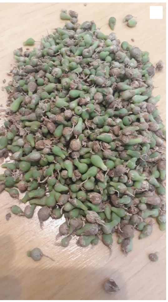
Nine people were arrested for the illegal possession of protected plants worth R350 000.

Many of South Africa's succulent plants are endemic to the Western and Northern Cape, making them highly sought after by international collectors.