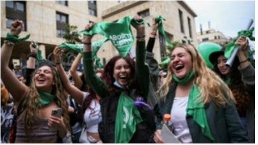
Colombia decriminalises abortion following regional 'green wave'